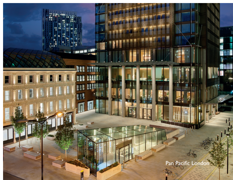
Pan Pacific London

Pan Pacific London is truly a serene haven away from the hustle and bustle, with every element carefully crafted and tailored to offer one of London's most complete contemporary and luxury hotel experiences.