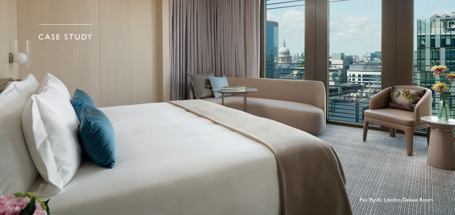
Pan Pacific London, Deluxe Room

Glenn Pushelberg explains the inspiration behind the design, "We wanted to deliver an oasis of tranquillity in this wonderful bustling city of London. Pan Pacific London is intended to feel tailored, calm, and serene without falling flat on metaphors or symbolism. We wanted our guests to be immersed in a worldly outlook that is rooted in warmth and comfort of the brands heritage."